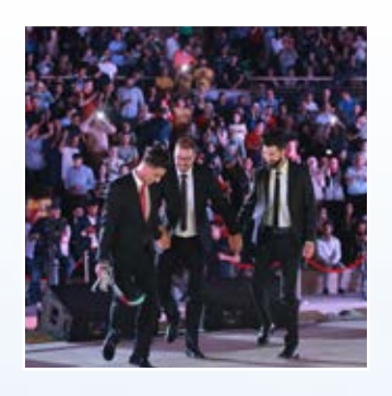
MOHAMMED ASSAF INAUGURATES RAWABI AMPHITHEATER