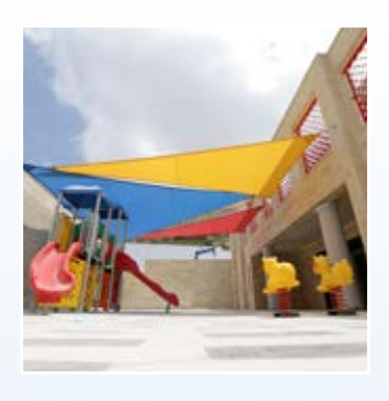
RAWABI ACADEMY TO START ITS 2016/2017 ACADEMIC YEAR